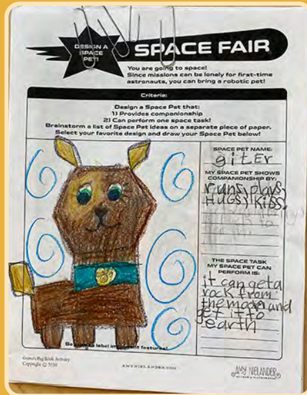
Quarton Elementary Author Visit Activity Sheet Birmingham, Michigan