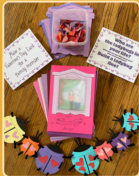
Bookstore Visit with Saturn Booksellers Gaylord, Michigan