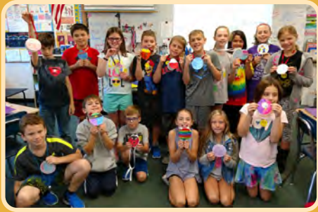
JFK 4th Grade Franklin, Massachusetts