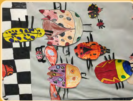
Loon Lake Elementary Hallway Display Wixom, Michigan