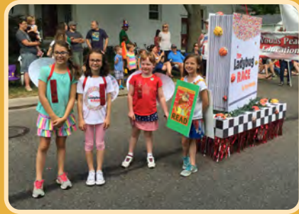
4th of July Parade Huntington Woods, Michigan